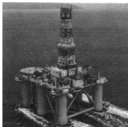
Western Oceanic Inc.