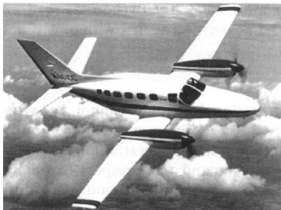
Cessna Aircraft Corporation